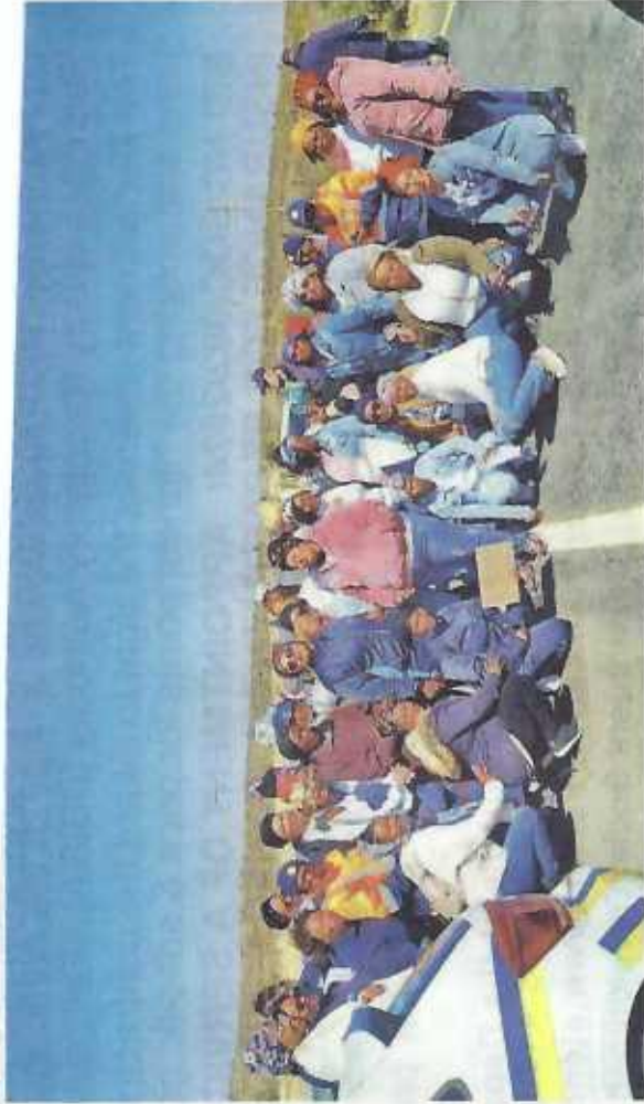
The group of volunteers who helped to make the day successful.

FARR would like to thank the Department and all the other collaborators for the successful day and valuable support. Together we can make a difference!