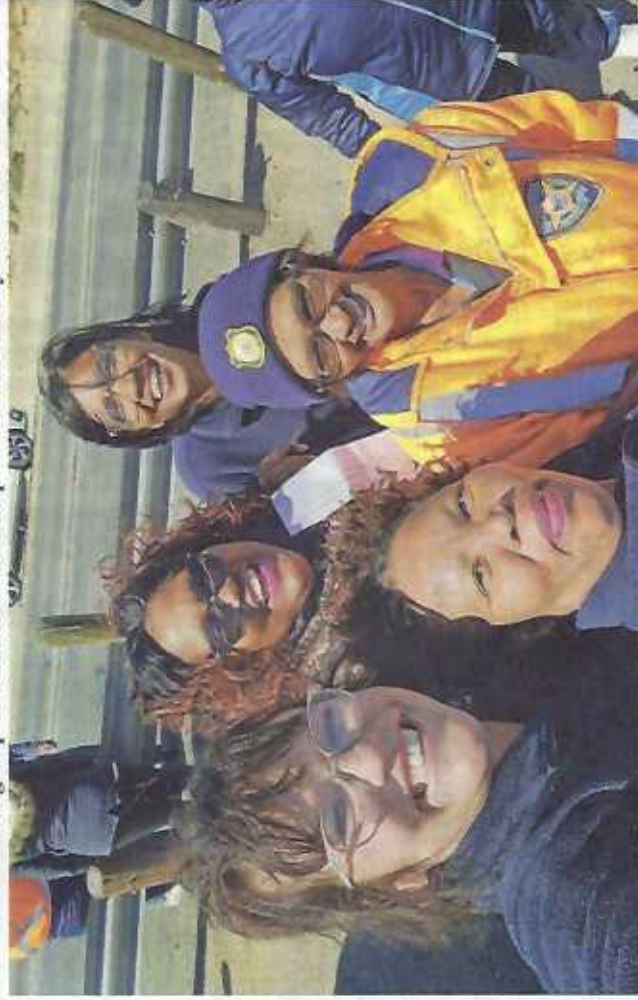
The FARR team with one of the Traffic officials.