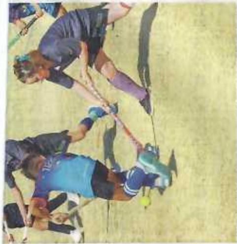
Die hokkiepelers van Pliatreland Akademie het goeie wedstryde in Aliwal gespeel.