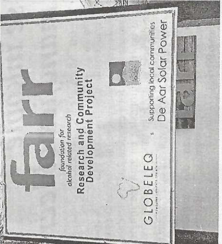
The notice board at the Britstown Office entrance.