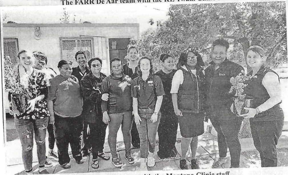
The FARR De Aar team with the Montana Clinic staff.