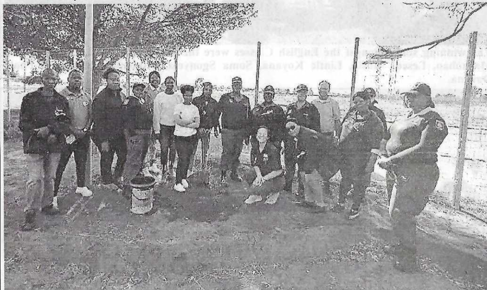
The FARR De Aar team at the SAPS on the 8th of September.