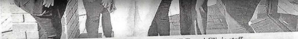
The FARR De Aar team with the KE Twani Clinic staff.