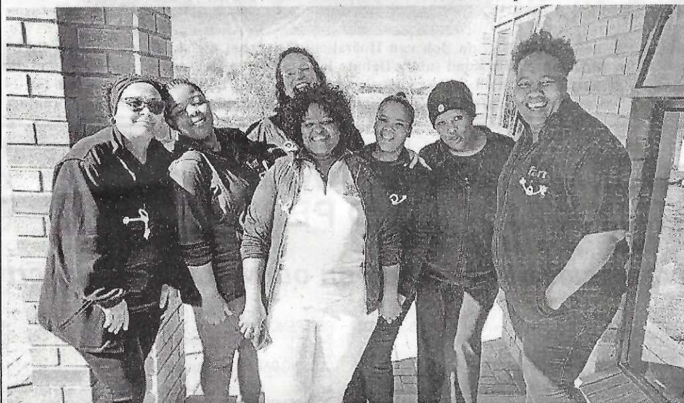
The FARR De Aar team with the KE Twani Clinic staff.