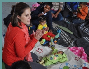
Teddy Day—Child Stimulation Day