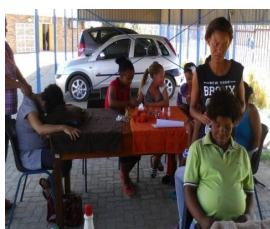
A HMHB® session in Kimberley

•The circle inside the knot symbolizes the uterus of the pregnant woman which should provide a safe environment for the unborn baby to develop free from alcohol.