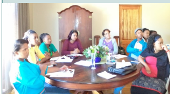
Community Workers training in De Aar