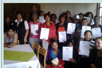
Participants of the FAStrap© course in the West Coast.