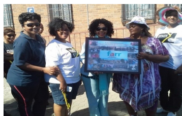
FASD Day (9 September) in Kimberley