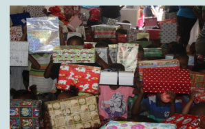
A gift for every child!