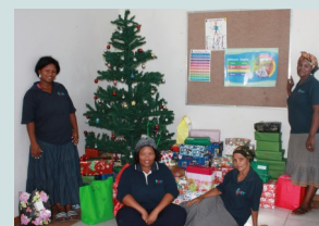
Community workers getting ready for the HMHB© Christmas party.