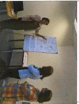
Learning can be fun...