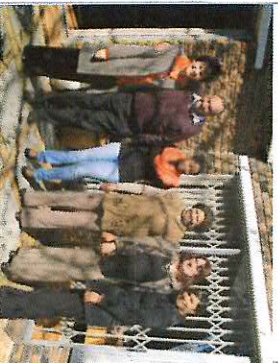
Hwasea site visit in August 2010